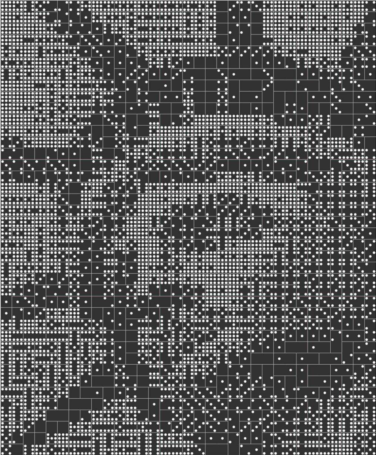
Figure 1: The Statue of Liberty rendered in 12 complete sets of double nine dominoes